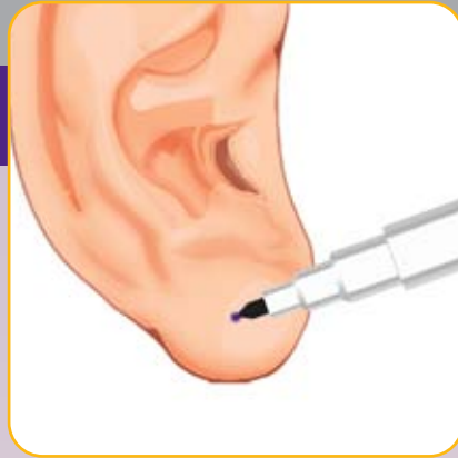
Mark the intended position