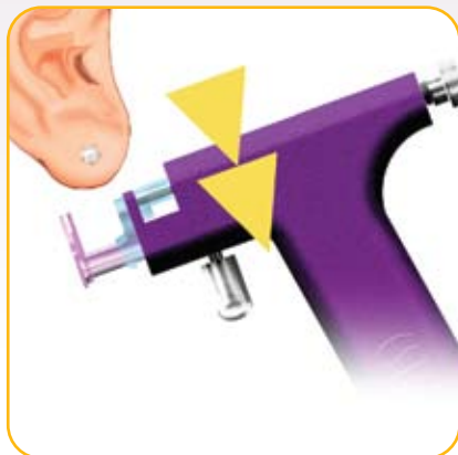
Lower the instrument away from the ear