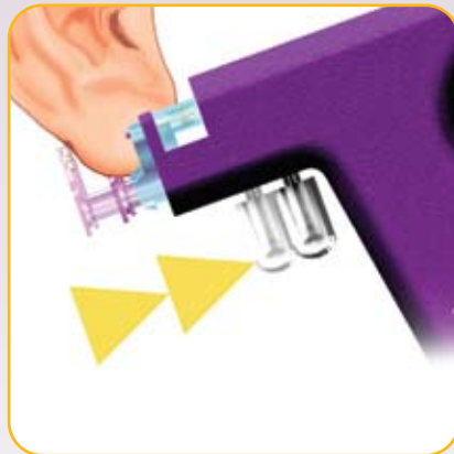
Align the stud, pull the trigger gently until it stops and hold