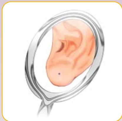
Confirm the position with the client

Other languages available at www.estelle.uk.com