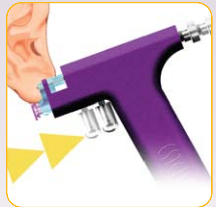
Pull the trigger hard to fire, then release