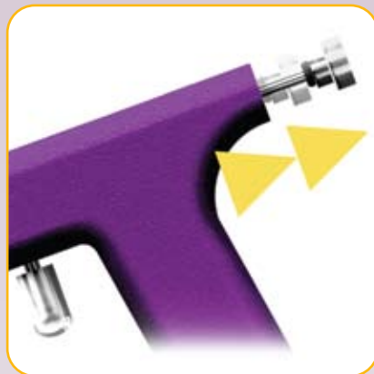
Pull back the plunger until it clicks