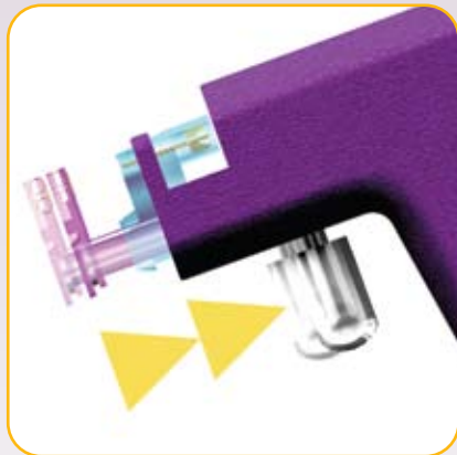
Pull the trigger gently to break the seal