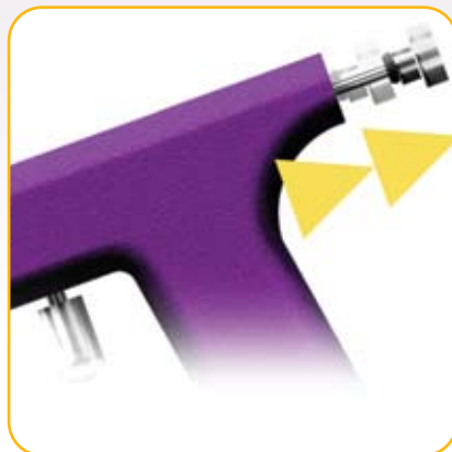
Pull back the plunger until it clicks